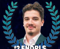
#2 ENDRI S. $216,435 OCTOBER 2022