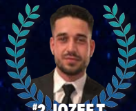
#2 JOZEFF T. $397,624 MARCH 2022