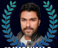
#2 MARSHALL F. $272,991 OCTOBER 2022