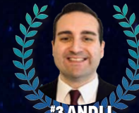
#3 ANDI I. $374,912 OCTOBER 2022