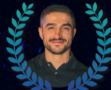
#4 FIRAT U. $3,704,327