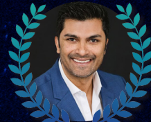
#12 MARSHALL F. $2,247,080