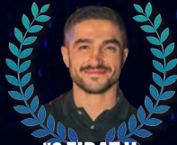
#3 FIRAT U. $254,177 JULY 2023