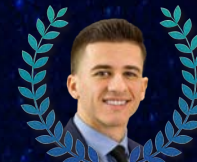
#3 TAULANT B. $758,380 OCTOBER 2021