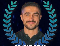
#5 FIRAT U. $228,898 AUGUST 2023